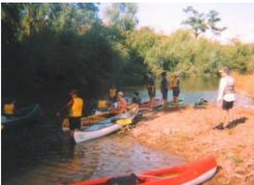
Hunter River - Aberdeen