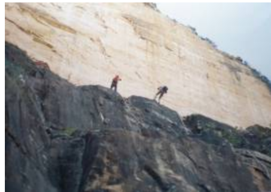
Dog Face - Katoomba

APPLICANTS - Older Venturers, Rovers, Leaders and Committee members