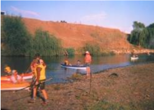
Hunter River - Aberdeen